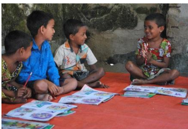
Rural schools do not have proper learning tools (Bangladesh, @NETZ e.V., 2015).