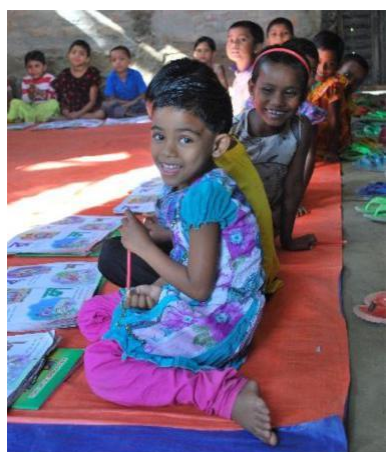
Good lessons are fun (Bangladesh, @NETZ e.V., 2015).

Bangladesh – A country with potential: More than 160 million people live in an area twice as large as Bavaria. 80 % live less than a meter above sea level. The ever-increasing water levels caused by climate change are already endangering crop yields and regularly cause severe flooding. Although the country has developed positively in economic terms, 2.6 million children still do not have access to school education. Generally speaking, the majority of young people in public schools hardly learn to read, write and to do algebra properly.