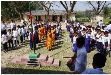
School meeting in the morning (Bangladesh, @NETZ e.V., 2018).