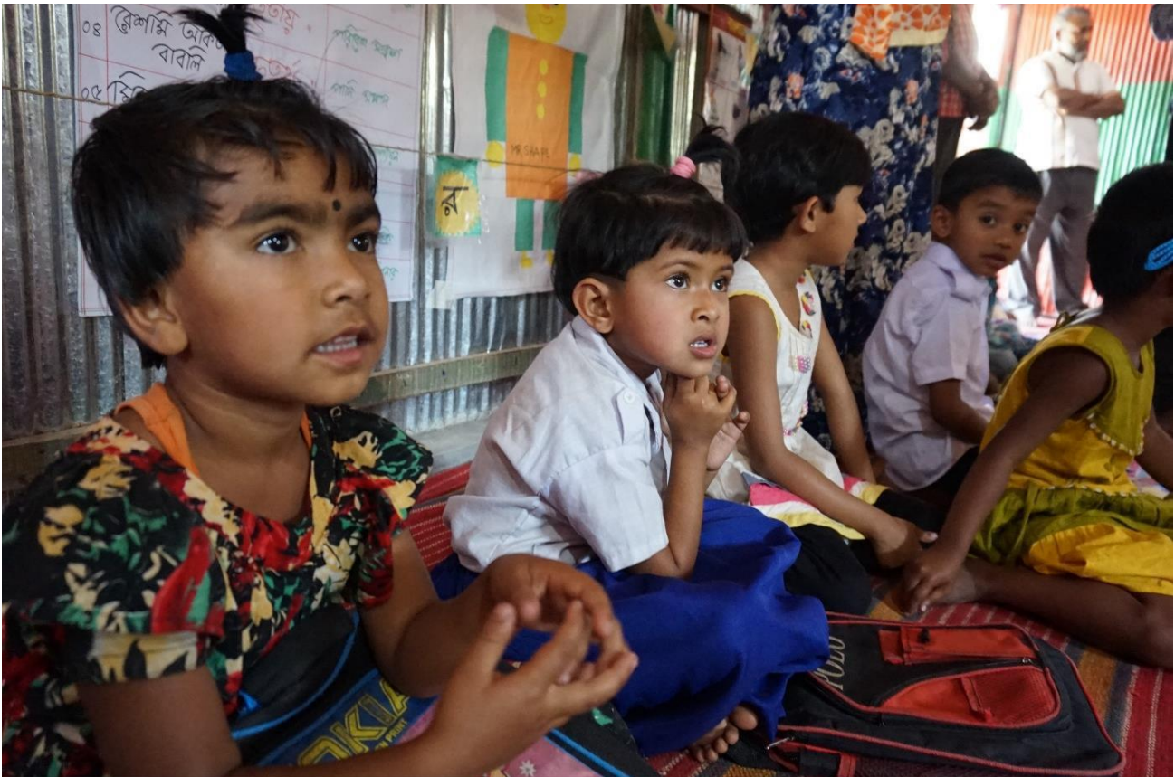
The little ones listen attentively to the classes in the preschool (Northern Bangladesh, @NETZ e.V., 2018).

(Project description and status, December 2018)